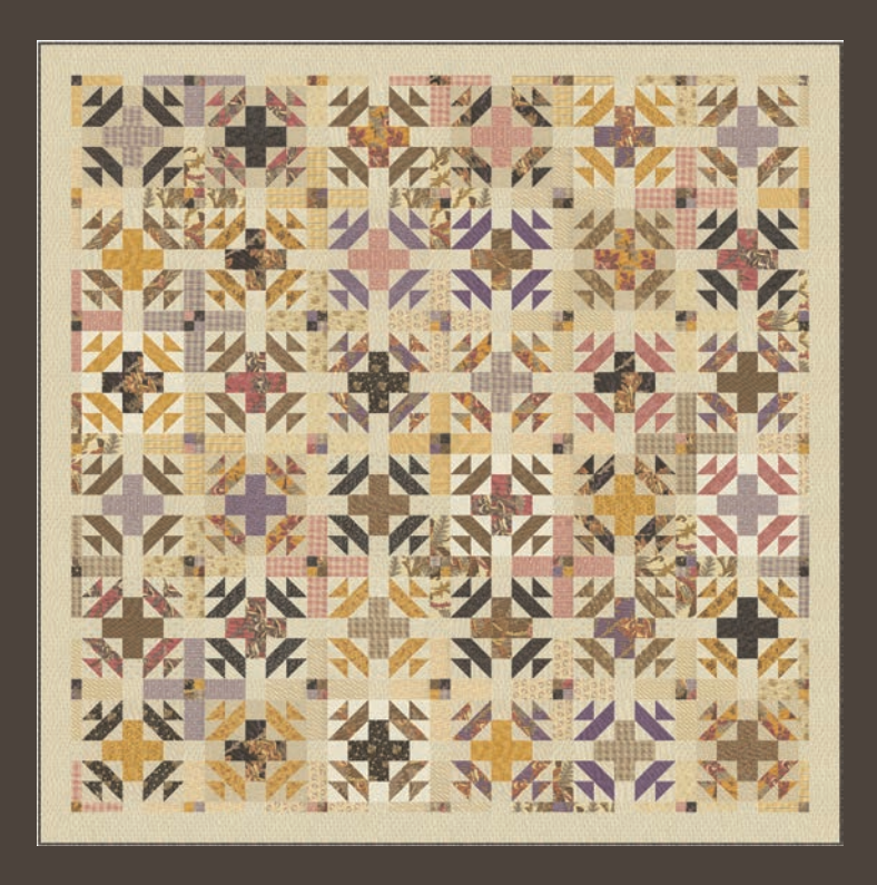
MOD 127 Hot Cross Buns 78" x 78" LC Friendly by Moda Fabrics