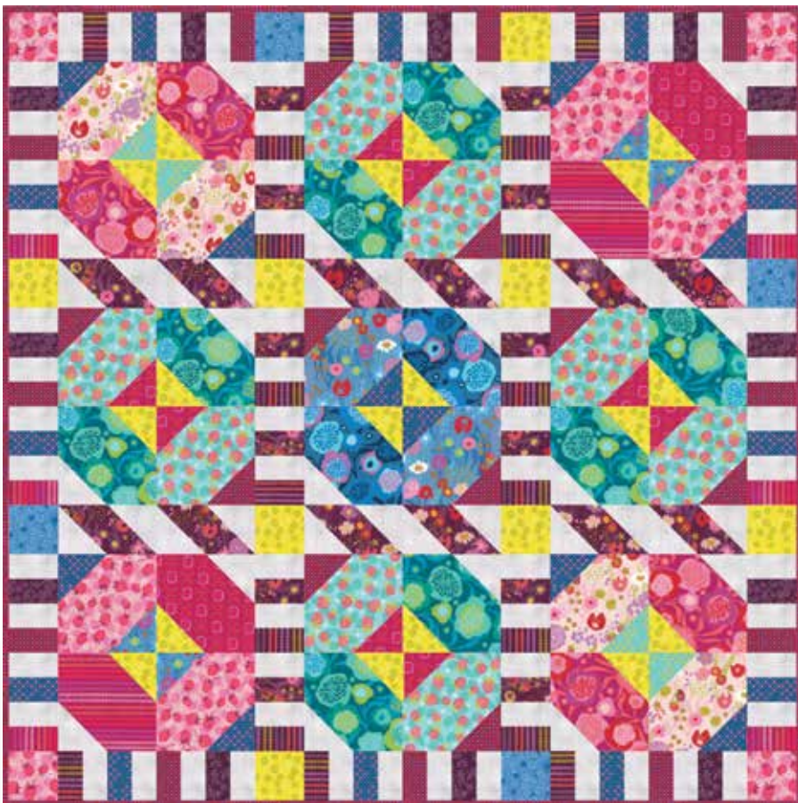
pattern by Crystal Manning CMA 864 / CMA 864G Penny Lane Size: 64" x 64"