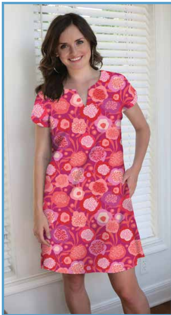
pattern by Indygo Junction Designs IJ 1151E / IJ 1151EG Shiff Dress