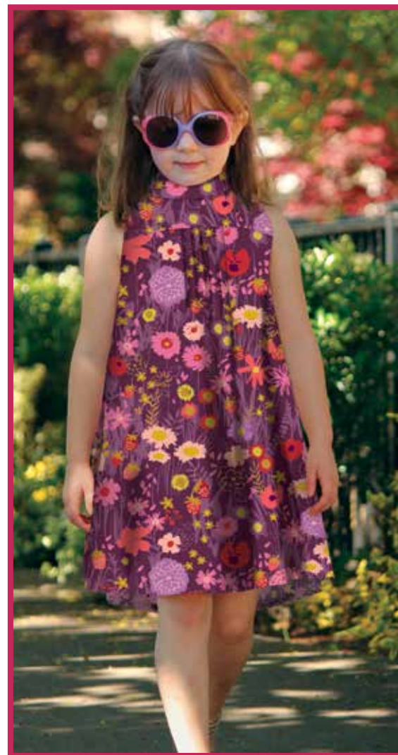
pattern by Olive Ann Designs OAD 97 / OAD 97G Rose

Painterly flowers are complemented with abstract patterns in Growing Beautiful, a vibrant new collection suited for garments and quilts. There is a peony print – one of my springtime favorites – and a field of wildflowers, all painted in a bold palette of reds, berries, eggplant, teal and a pop of chartreuse. There are four Growing Beautiful prints on Rayon, it's lovely drape is perfect for dresses, shirts and skirts.