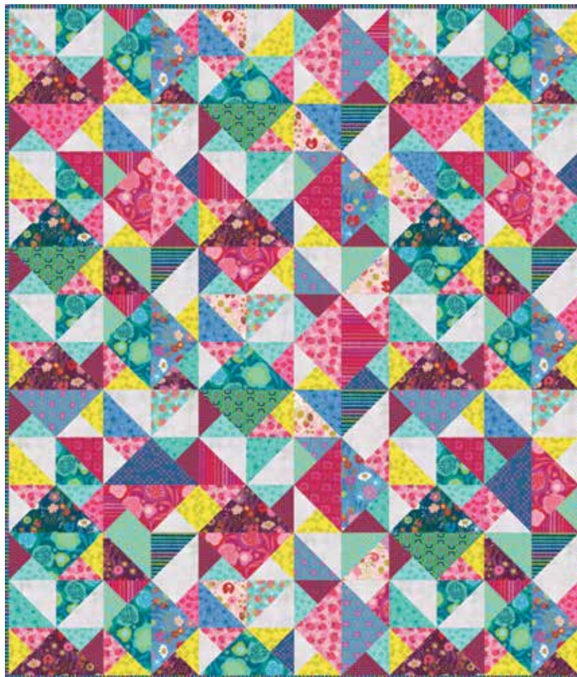
pattern by Crystal Manning CMA 865 / CMA 865G Strawberry Rhubarb Size: 72" x 84"