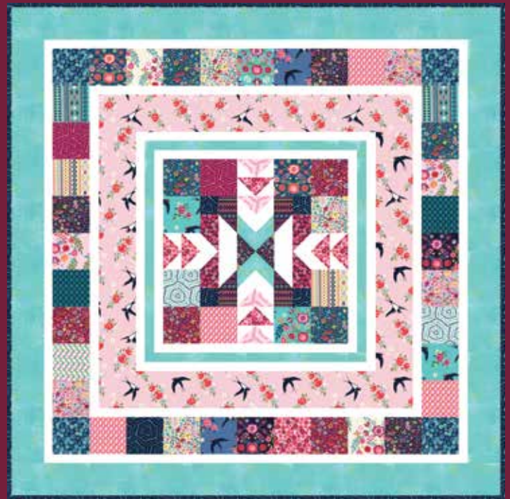
CMA 863/ CMA 863G – Wanderlust 54" x 54"