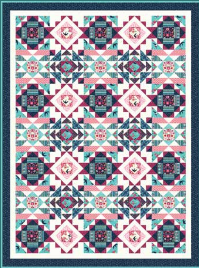
CMA 862/ CMA 862G – Danza 72" x 92"