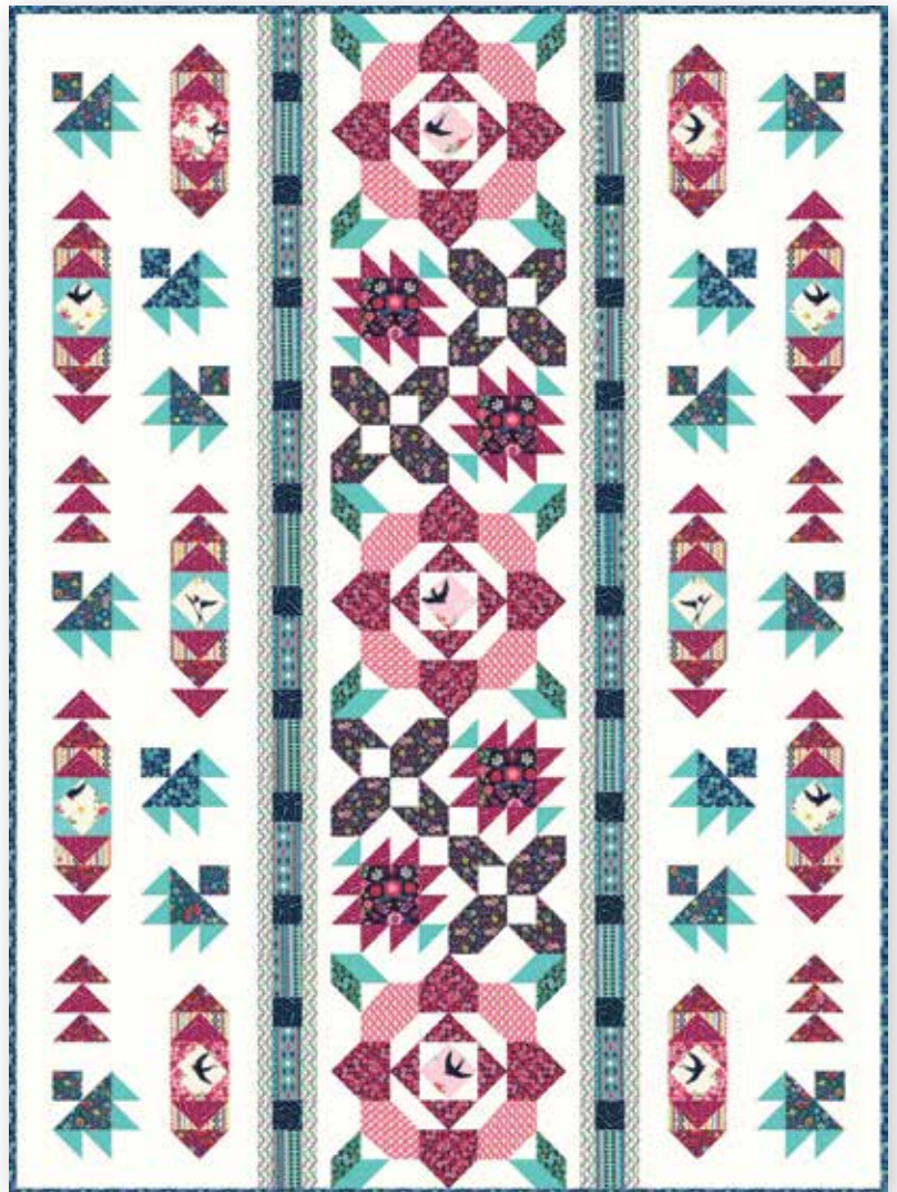
CMA 860/CMA 860G – Soul Catcher 60" x 80"