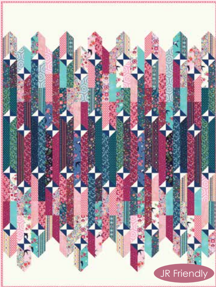
CMA 861/ CMA 861G Take Flight – 60" x 80"